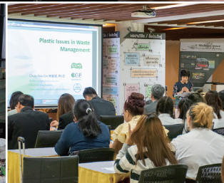
Creating a platform for industry-academia cooperation