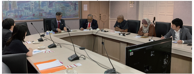
Discussing future cooperation between Taiwan and Malaysia with the Chairman and representatives of the Malaysia Productivity Corporation

In recent years, the Government of Malaysia has set various environmental policy objectives while actively promoting green technology policies and low carbon cities projects in addition to setting various environmental policy objectives. The Green Technical Service Team will align its efforts with the Malaysian government's environmental policies and promote Taiwan's advanced green technology, recycling policy system and technical knowhow through technology sharing, establishment of APO demonstration sites or invitations to businesses to invest in Malaysia. The goal is to create demand in the Malaysian market for relevant products and services, while assisting Taiwanese businesses introduce technology or products related to renewable energy, energy storage and smart cities into Malaysia.