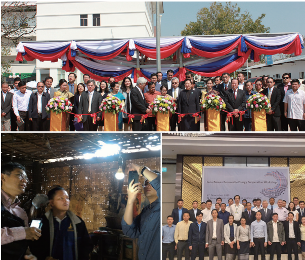
Surveying the economic circumstances and electricity usage of people in off-grid rural communities in Laos