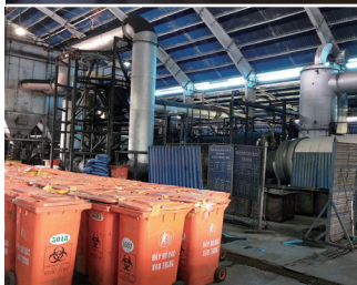
Visiting Vietnamese environmental technology companies to discuss cooperation