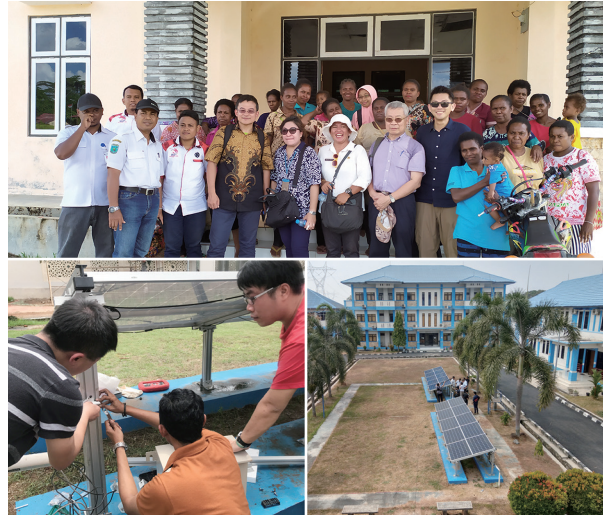
Industry-academia cooperation guiding seed teachers in Indonesia