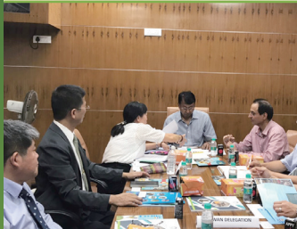
Undertaking a Public Private Partnerships (PPPs) Strategy Meeting with NPC India