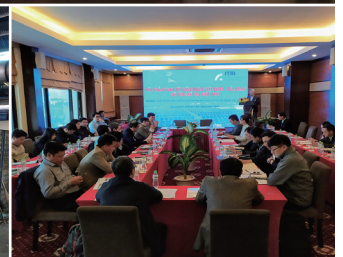
Holding Taiwan Vietnam technical forums on circular economy technology