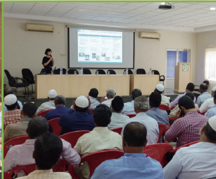
Jointly holding workshops on new developments in Effluent Treatment for Tanneries with ILIFO Foundation