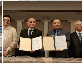
Facilitating the signing of a MOU between industry associations in Taiwan and the Philippines

Exchanging policies bilaterally and ideas to promote environmental education