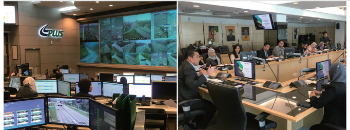
Investigating the needs assessment for Smart Highway Management in Malaysia