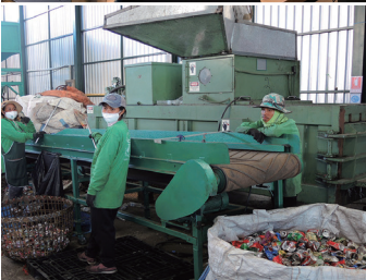
Establishing the cooperation for waste management companies