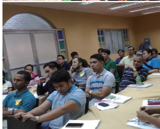
Cooperating with the NPC on specialist technical training courses